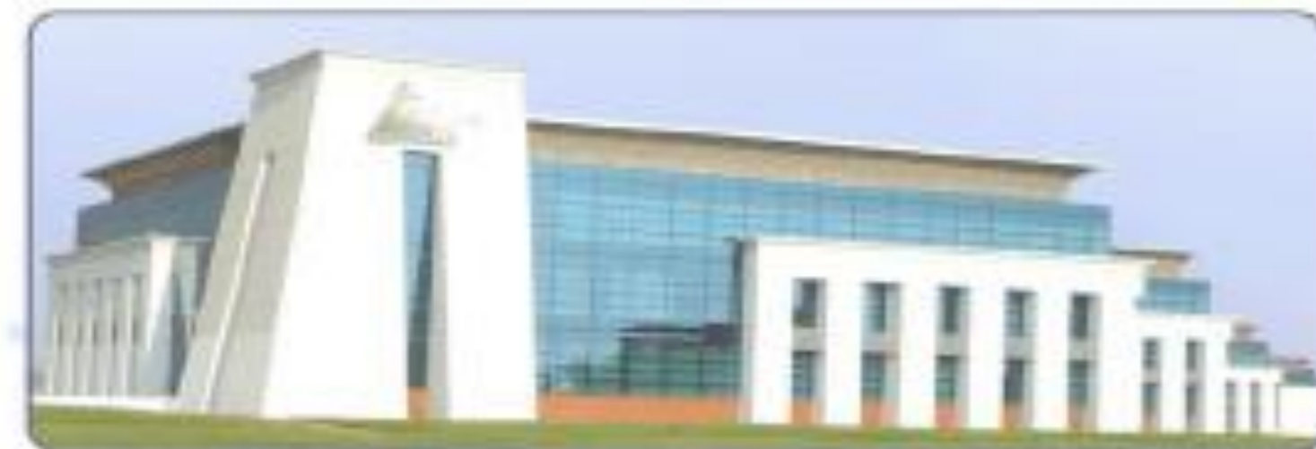
The National Telecommunication Regulatory Authority