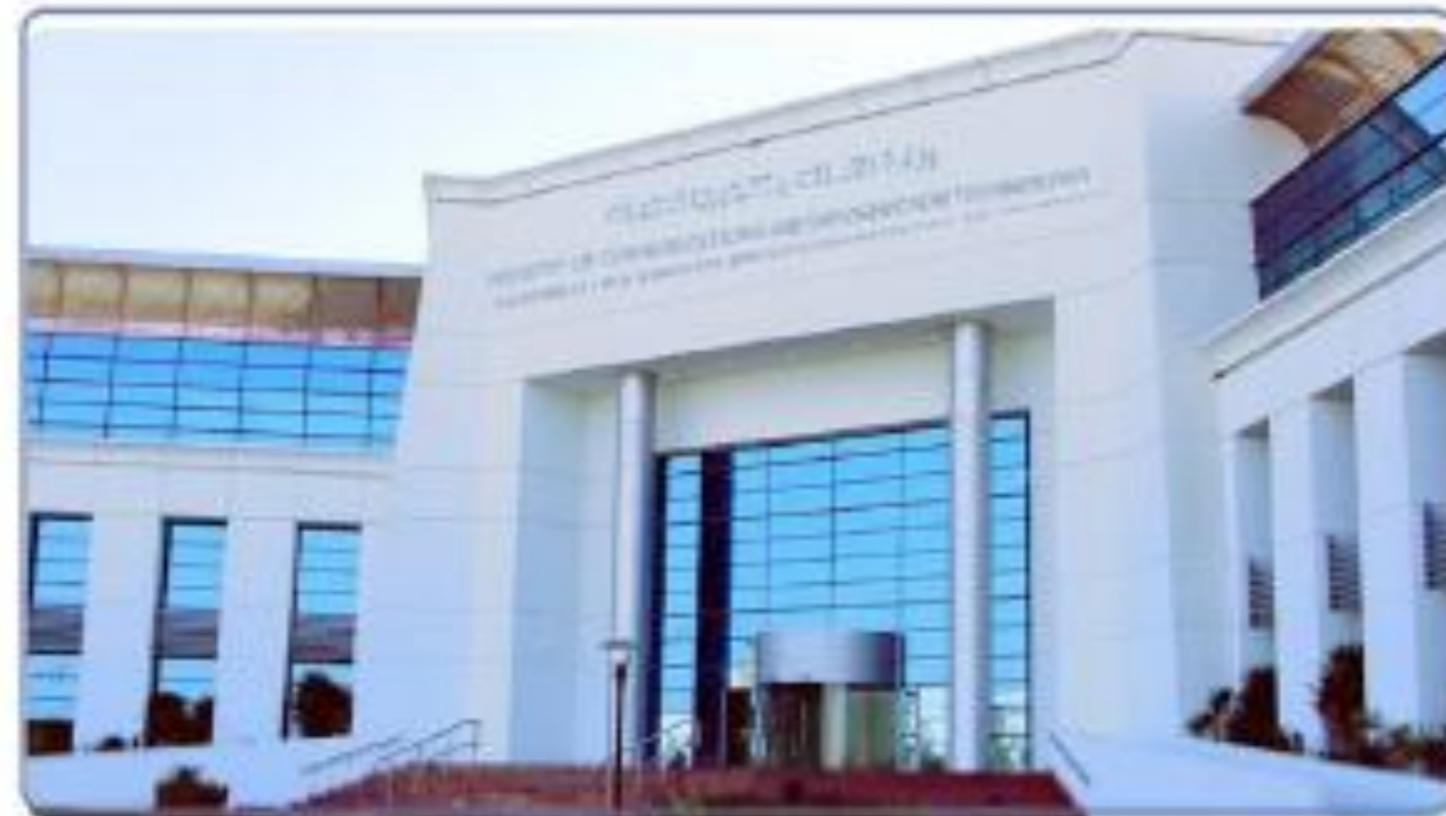
Ministry of Communications and Information Technology