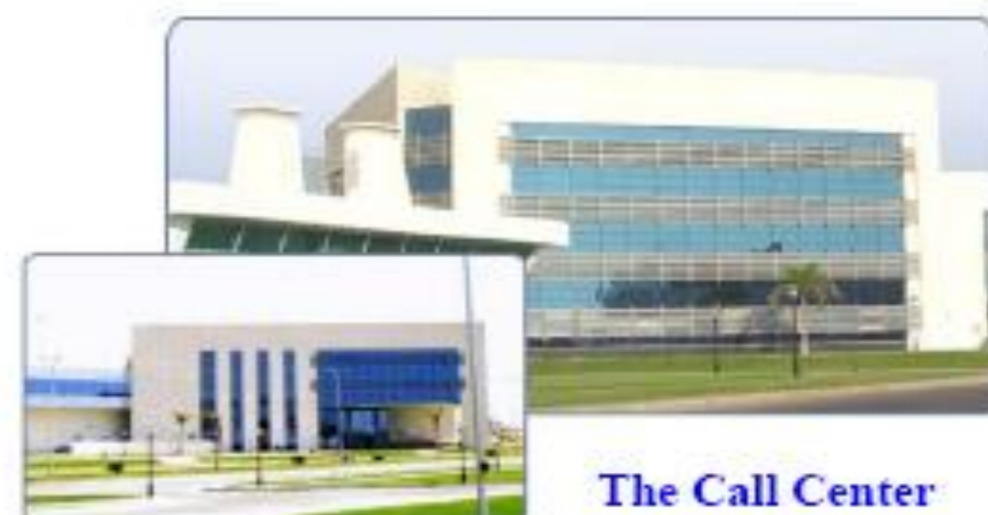
The Call Center